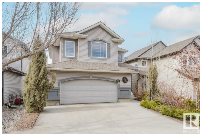
1912 121 St SW, Edmonton, AB