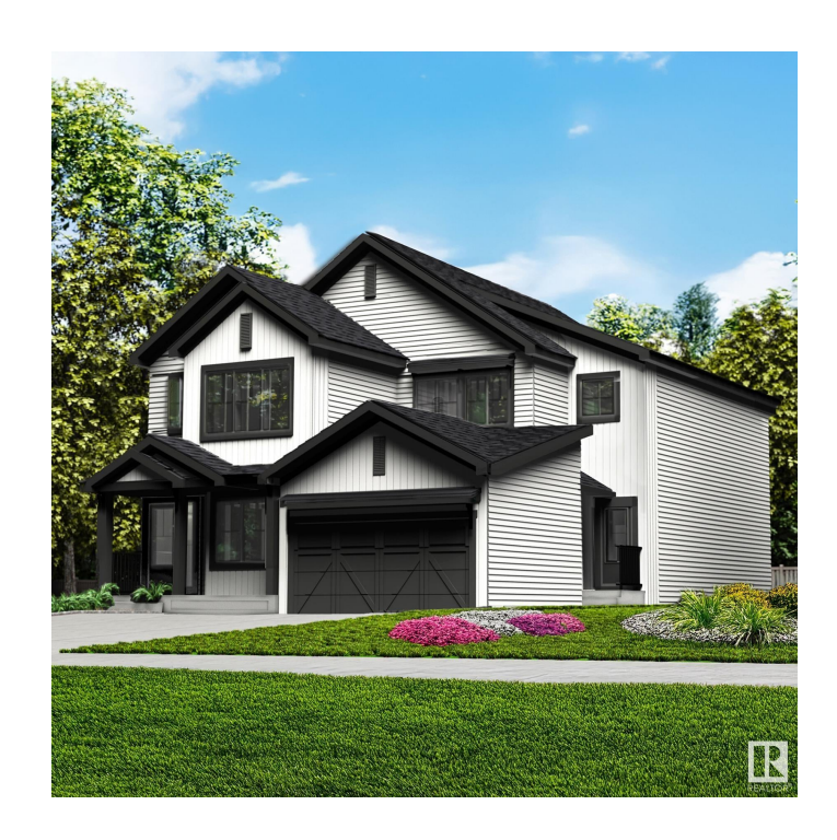
The Retreat | 1,367 Sq. Ft.

GREAT LEGAL SUITE POTENTIAL! Discover this investor's dream in a stunning modern duplex with nearby trails and natural scenery. This 1,367 sq ft 3-bedroom, 2.5-bath home boasts a main floor open-concept layout with 9 ft. ceilings, luxury vinyl plank flooring, and a gourmet kitchen featuring a central island with quartz countertops, undermount sink, flush eating ledge, over-the-range microwave, full-height tiled backsplash, and soft-close doors and drawers. Upstairs, retreat to the expansive primary suite featuring a walk-in closet and a luxurious 4-piece ensuite that offers a spa-like atmosphere with double sinks. There are two additional bedrooms, a 3-piece bathroom, and a convenient laundry room. Additional features include a double car garage with a floor drain, a separate side entrance, large triple-pane windows, and a sliding patio door. In the basement, you will find rough-ins for a potential future legal suite, too! Maximize your rental yields with this high-quality, versatile property.