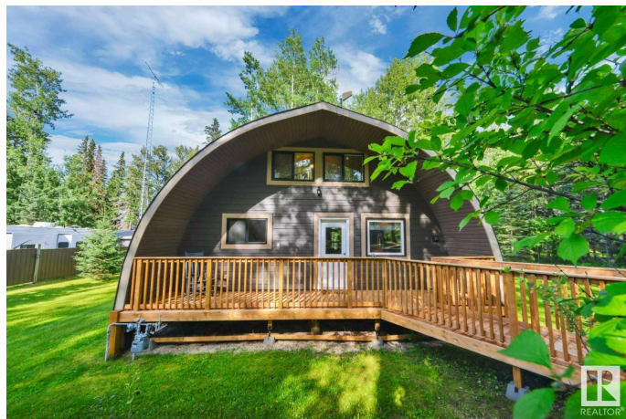
77 Township Rd 462A, Wetaskiwin County, AB